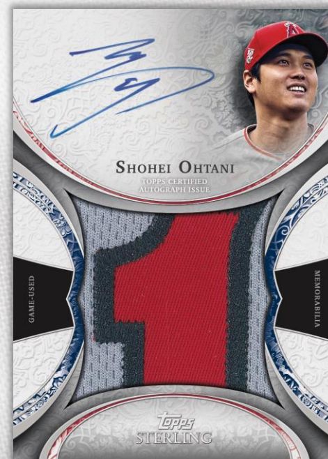
Sterling Splendor Jumbo Autographed Patch Card

Found exclusively in hobby shops in March 2022