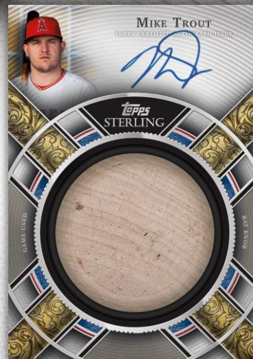
Sterling Autographed Bat Knob Card

Legendary Cut Signature Relics – Vintage cut signatures alongside 2 game-used relics.