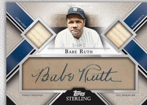
Legendary Cut Signature Relic Card