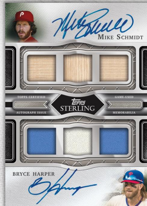
Sterling Sets Dual Autographed Relic Card